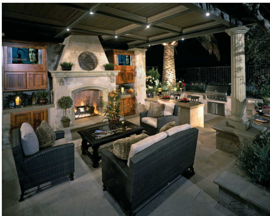
Geoscape Landscape Construction, Lake Forest, California.