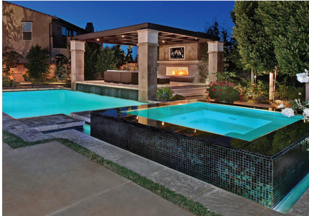
AMS Landscape Design Studios, Newport Beach, California.