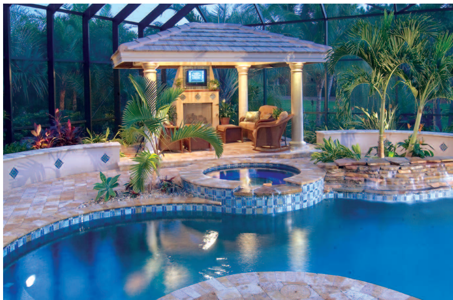
Ryan Hughes Design, Palm Harbor, Florida.

The client interview can’t be superficial. A careful designer will probe deeply, looking for details that ensure he’s on the right path to meet his client’s expectations.