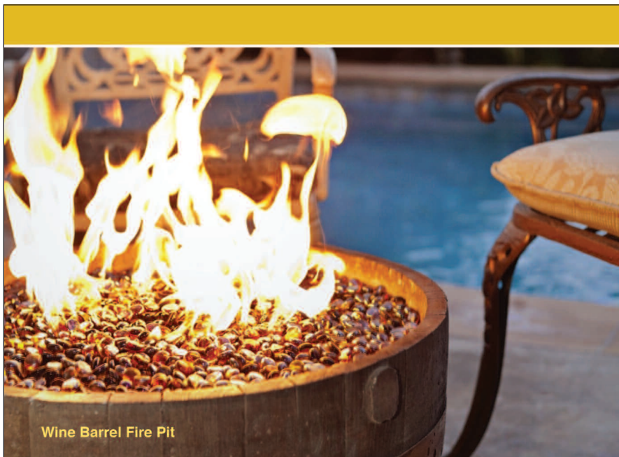
Wine Barrel Fire Pit